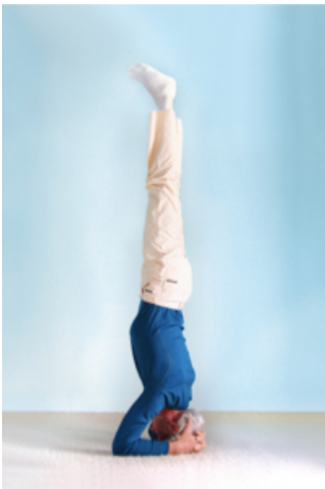
The headstand shows a graceful vertical line